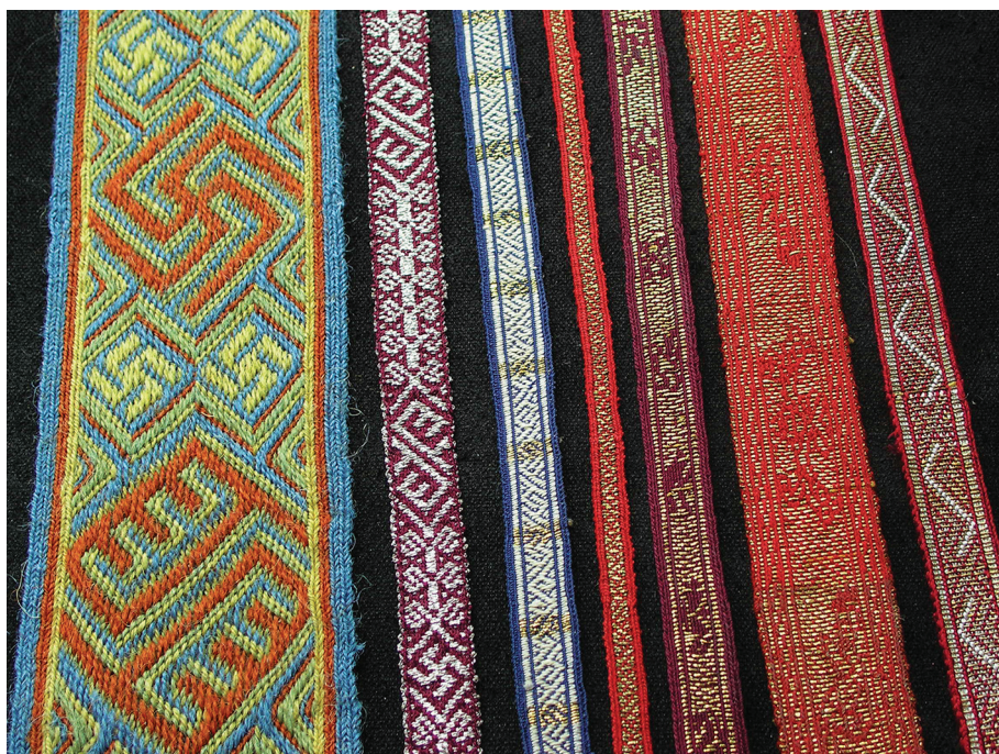
Fig. 5.2: Reconstructions of some tablet-woven borders dated between 450–1300 CE. From left: border from Snartemo, Norway; border from Birka in Sweden, border from Mammen in Denmark; three borders from Durham in England and a border from Schleswig, Germany (© Lise Ræder Knudsen).

To my knowledge, not many finds of tablet weaving from an archaeological context are known from outside Europe, but very many examples of tablet weaving are known from modern times throughout the world. To mention just a few: In Turkey rather coarse bands in simple techniques with patterns in different colours are used, for instance for bridles. The same weaving technique but used with finer yarns is part of the Norwegian traditional costume from Telemark (see chapter by Klepp et al. , in this book, where in Fig. 26.3, the lady who is 2nd from right wears a traditional costume from Telemark with a wide tablet-woven belt, and also a smaller tablet-woven one twisted around in a spiral as a headband). It is also found as belts from China and Nepal (Fig. 5.3). In Iran, fine silk bands with double-faced weave bearing verses from the Koran are known. From Indonesia, bags made of many colourful double-woven bands sewn together are known and in Gondar, Ethiopia, huge silk wall hangings woven in a double tablet weaving technique are seen. Curtains from Gondar found partly at the British Museum's collections and partly in those of the Royal Ontario Museum seem to be the largest tablet-woven textile in the world (Figs 5.4 and 5.5).