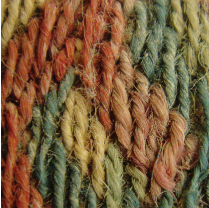
Fig. 5.8: Detailed close up of the tablet-woven border dated about 800 CE from Fort Miran in the Taklamakan Desert in China at present in the collection of the British Museum, MAS.622.

There are more tablet-woven borders in the same technique preserved from Sir Aurel Stein's excavations in Fort Miran, but to my knowledge there are no other finds