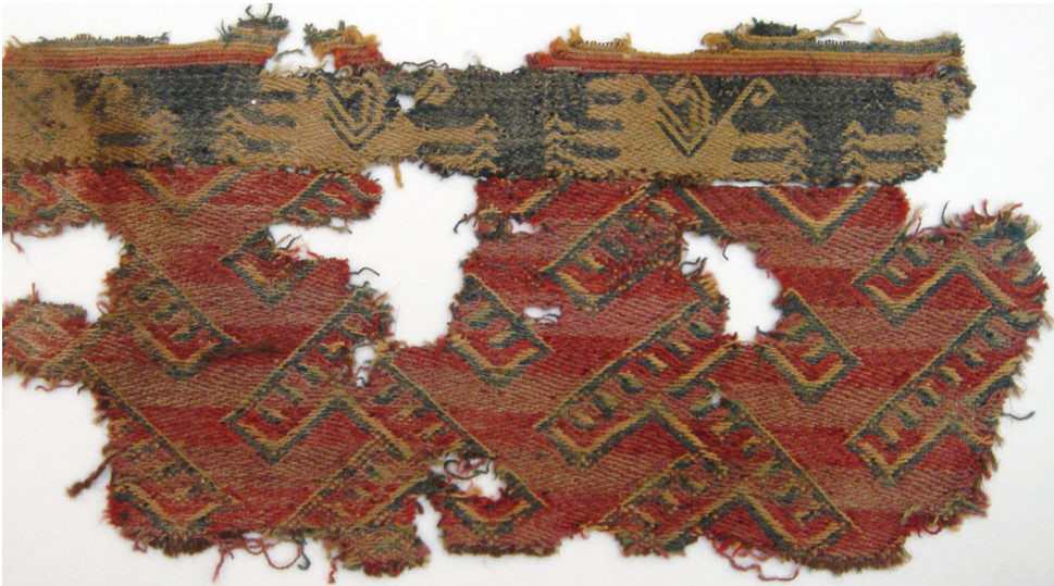
Fig. 5.7: Tablet-woven border dated about 800 CE from Fort Miran in the Taklamakan Desert in China. The border with the animals is sewn together with another border in a red geometrical pattern also woven using tablets. The yarn is made of the finest white yak wool and dyed. The border with the animals was woven using about 40 tablets and the border with its geometrical pattern needed at least 180 tablets, in all about 880 threads were used. This fragment is at present in the British Museum, MAS.622. At the Victoria and Albert Museum, London, another fragment of the same border is kept, and even if it is less well preserved, it is wider than this one. The entire width of the two borders is at least 20 cm (© Trustees of the British Museum).

The yarn used to produce the border is thin and evenly spun (Fig. 5.8). It looks like very fine sheep wool, but in fact it is made out of yak wool (Ryder 1999). The yak is common in some parts of Tibet, and both a large, brown or black wild form – and a smaller domesticated yak is known. The domesticated yak can have wool of many colours, among them white. The yak is used for travel, for working the sparse fields, for transport, for meat, milk and butter, for wool, skin, and as a pack animal. The wool of the yak varies in quality: The coarsest fibres come from the belly and are used for felt needed for, e.g. tents. The middle quality wool comes from the sides and the rear part of the animal and is used for bags and blankets, while the wool of the neck is extremely fine and resembles the finest wool like Kashmir or Pashmina. The wool used to produce the fine borders from Fort Miran was white and it is obvious that it must have been dyed even though we do not have any dye analysis of the yarn. The dyestuff used to produce the very fine colours was normally from plants and sometimes insects.