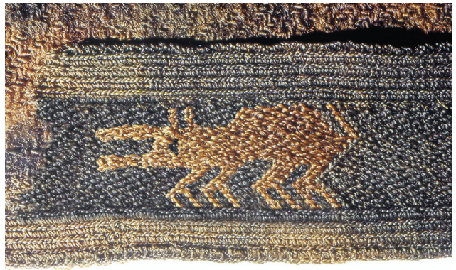
Fig. 5.10: Detailed close up of the far left of the tablet-woven border found on the tunic in a chieftain's grave from Enebø-Eide in Norway. The colour difference is digitally enhanced using Photoshop, to make weaving details more visible. Note that the legs and the eye of the animal are quite similar to the animals on the border from Fort Miran (Courtesy of Bergen Museum).

So is this a coincidence or is there a connection? It is difficult to say – a safe answer would be that this is an example of parallel evolution and that these phenomena occur in cultural history as well as in natural history.