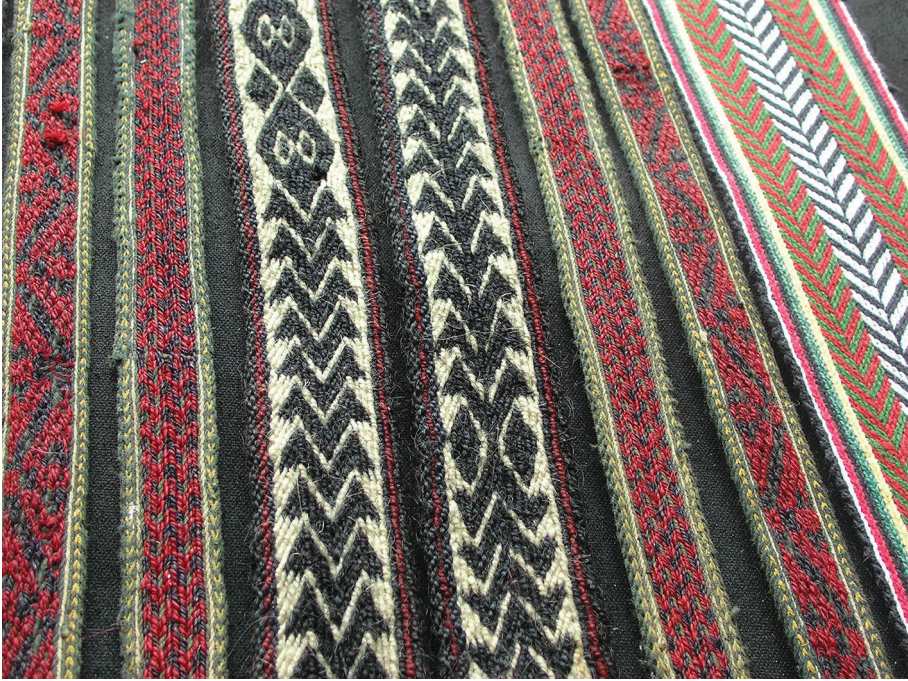
Fig. 5.3: Tablet-woven borders recently bought in Turkey and Nepal by glass-bead expert Torben Sode (© Lise Ræder Knudsen).

Moreover, there are bands woven in variations of the same double weaving technique from Tibet, Burma, India, Bulgaria, Caucasus, Greece, Israel and Java. Tablet weaving is found everywhere from Japan to North Africa and Iceland. But there is no evidence of tablet weaving from Australia, South Africa and the Americas (Schuette 1956). As can be seen here, tablet weaving is an ancient technique with many different pattern techniques. And a very interesting feature is that at times, ancient tablet weaving was made in very intricate and unknown techniques requiring a high mathematical ability on the part of the weaver.