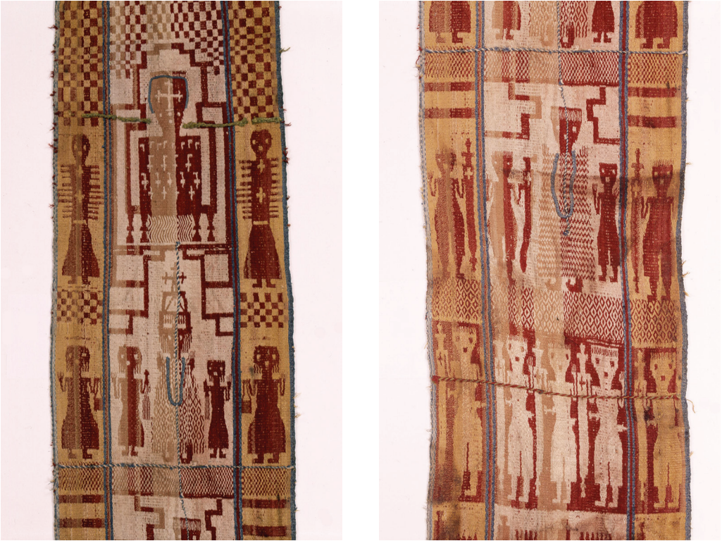
Figs 5.4 (left) and 5.5 (right): Details of silk hanging used to conceal the entrance to the Holy of Holies (Q'edus Q'edusan) of a church in Gondar, Ethiopia measuring 3.06 m × 0.63 m; No. Af1868,1001.22AN295853 and No. Af1868,1001.22AN295855. The curtains are divided into panels each woven using more than 300 tablets. They may have been woven by Jewish or Arabic weavers using Chinese silk and it shows, among other things, King Bakaffa (r. 1722–1730 CE) and his family wearing blue ribbons as a sign of their Christian faith. Furthermore, the soldiers guarding the family are carrying weapons of Indian manufacture. This textile kept at the British Museum is an example of a truly global textile encounter; yet another curtain from the same church kept at the Royal Ontario Museum in Canada is believed to be the largest tablet-woven textile in the world measuring 5.22 m × 2.18 m.

layer of threads and thus making a shed. A weft thread is passed through the open shed and the tablets turned again. The four warp threads of each tablet are thus twisted around each other and the many twisted threads of the border are kept in place by the weft thread. This is the simplest and most common variation of tablet weaving, but using different colours in different holes of each tablet, a different colour in different tablets or turning the tablets in different directions make it possible to make endless amounts of different and very complicated patterns. In modern times, mostly the more simple variations are seen, but in ancient times highly complicated techniques were also used. Indeed, some of these techniques have puzzled researchers for years.