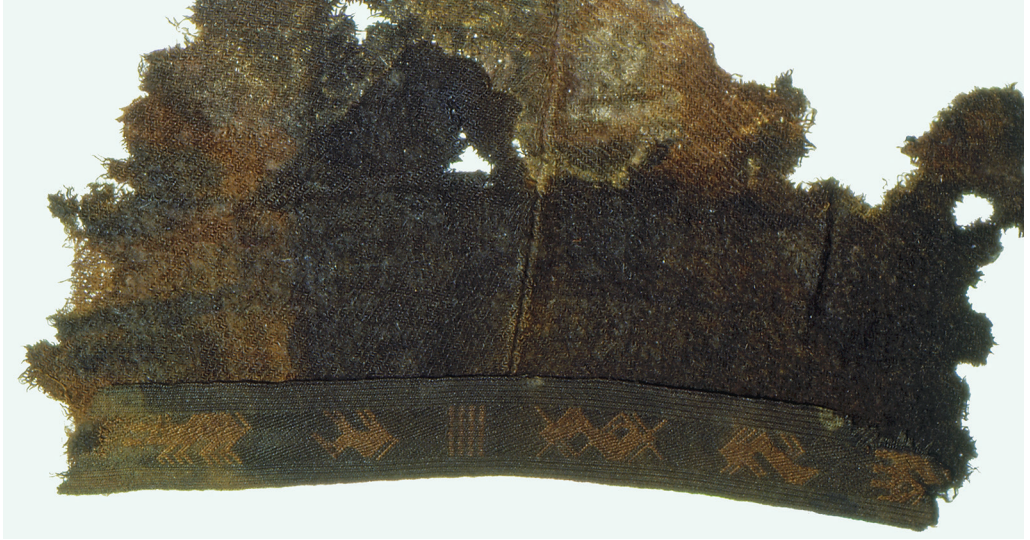
Fig. 5.9: Tablet-woven border found on the tunic in a chieftain's grave from Enebø-Eide in Norway. The intricate weaving technique and design of the animals are similar to the find from Fort Miran (Courtesy of Bergen Museum).

Fig. 5.10: Detailed close up of the far left of the tablet-woven border found on the tunic in a chieftain's grave from Enebø-Eide in Norway. The colour difference is digitally enhanced using Photoshop, to make weaving details more visible. Note that the legs and the eye of the animal are quite similar to the animals on the border from Fort Miran (Courtesy of Bergen Museum).